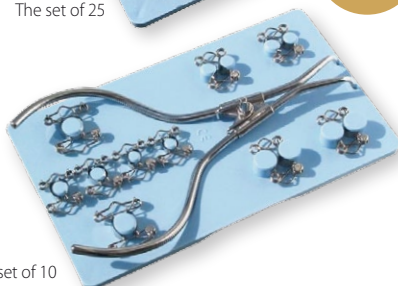
The set of 10

Set of 25 on a sterilisation tray with forceps