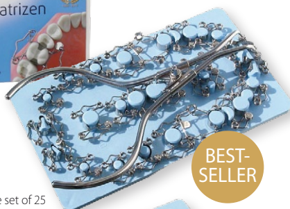
The set of 25